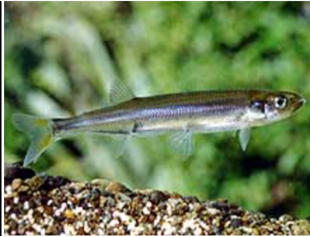
Left: The freshwater jellyfish Craspedacusta sowerbyi . Source: https://niwa.co.nz/publications/water-and-atmosphere/vol10-no2-june-2002/alien-predator-freshwater-jellyfish-in-new-zealand . Right: The common smelt Retropinna retropinna . Source: https://www.doc.govt.nz/nature/native-animals/freshwater-fish/smelt/